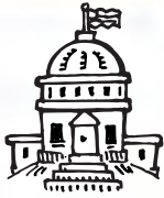
My Nation's Capital